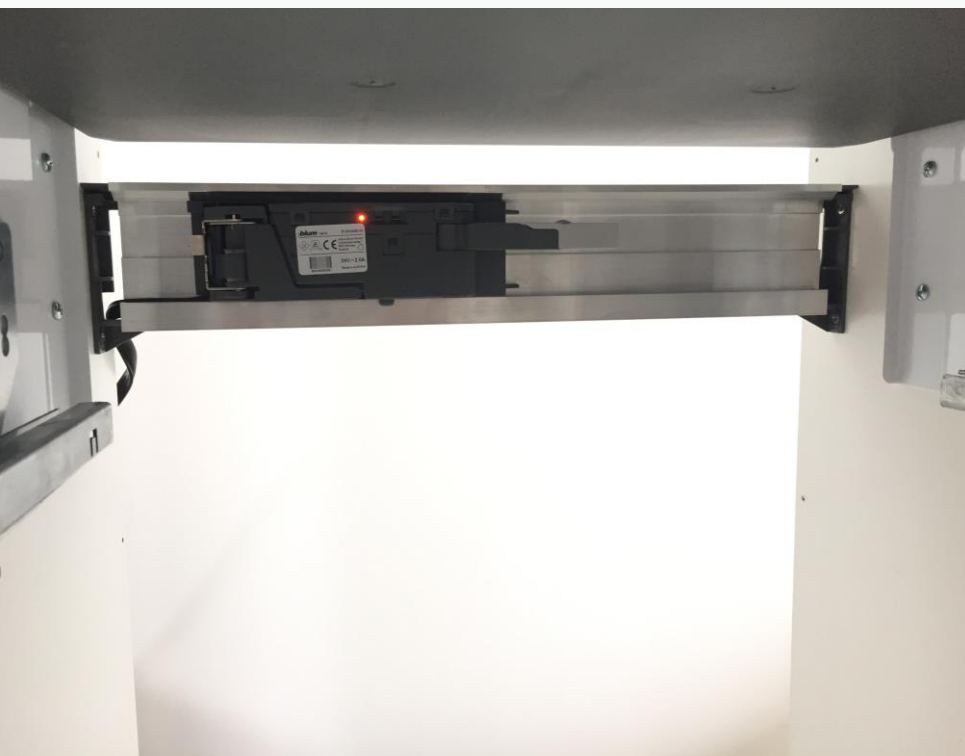
Blum Servo Drive installed behind Concelo Bin Unit.